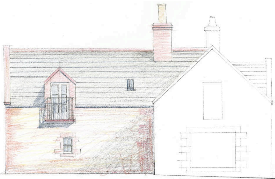
West elevation, sketch illustration.