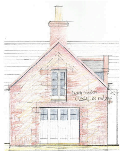
North elevation, sketch illustration.