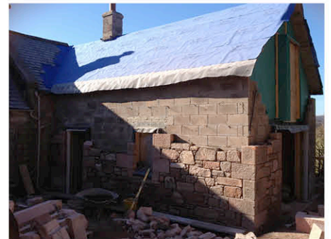
Images showing extension progression.